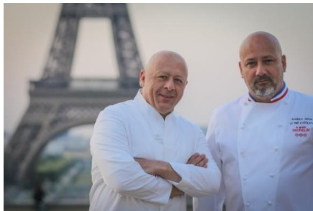
Thierry Marx, starred chef at the Brasserie (left) & Frédéric Anton, starred chef at the Jules Verne

As the standard bearer for an extraordinary know-how, the Eiffel Tower also represents French-style excellence. Because the catering offering is an integral part of the visitor's experience, the tastes and flavors must be up to par.